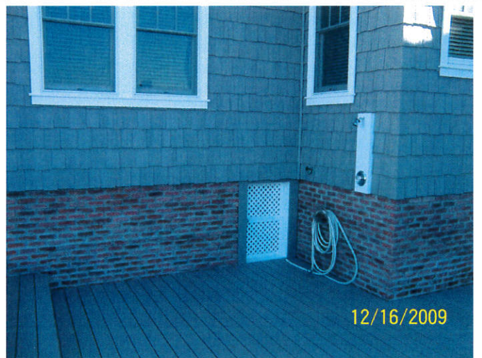
Left Side View – Date of Photograph: (See Photo Stamp)